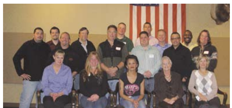
Class of November 2011