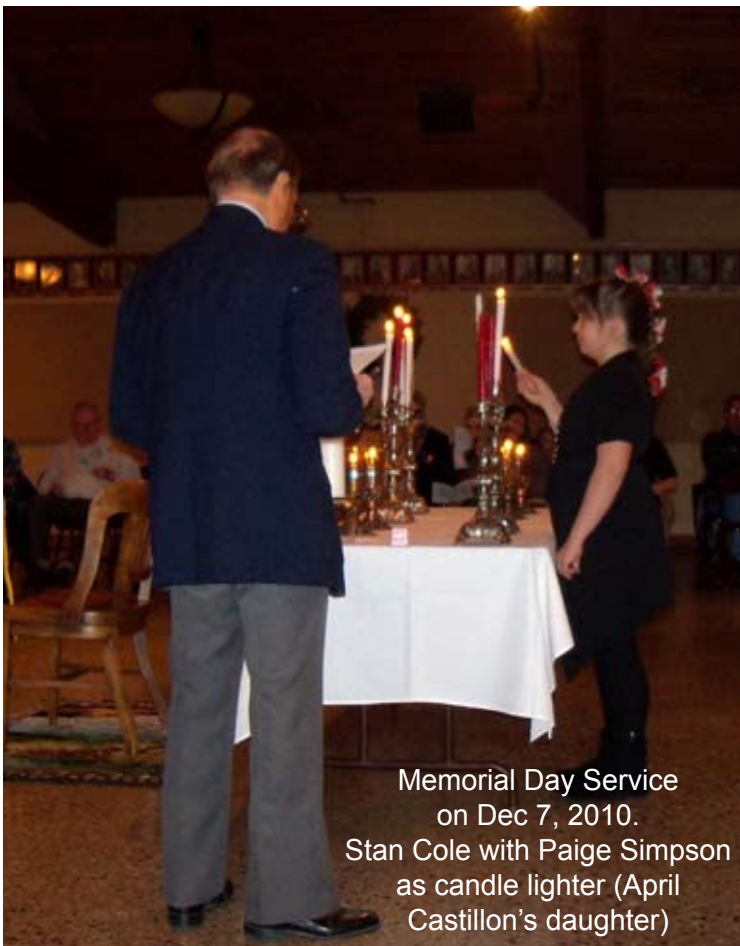
Memorial Day Service on Dec 7, 2010.

phone: 773/755-4728, email: enf@elks.org , website: www.elks.org/enf