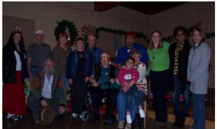
Children's Christmas Party, Santa with children, and the volunteers on Dec 4, 2010