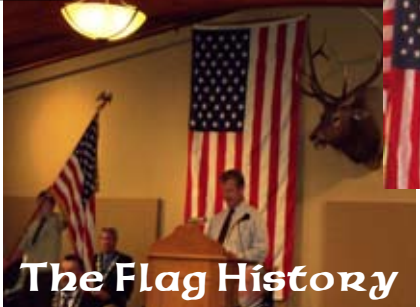
The Flag History