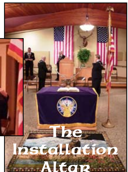
The Installation Altar