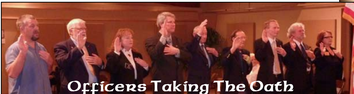
Officers Taking The Oath