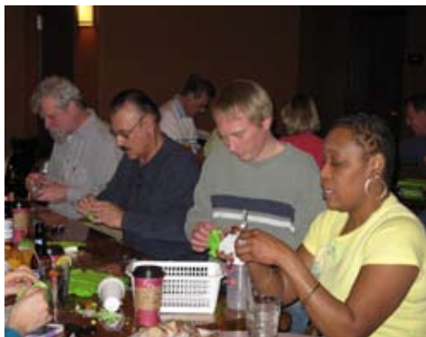
Members hard at work making decorations for the St. Patty Day Float