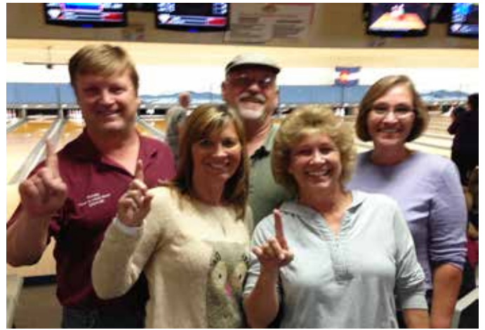
Bowling Tournament for Elks National Foundation Fund Raiser