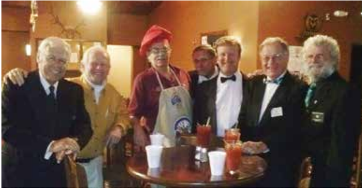
Past Exhaulted Ruler Breakfast Fund Raiser