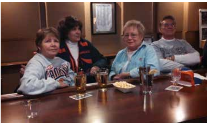
At least Al is watching the game.