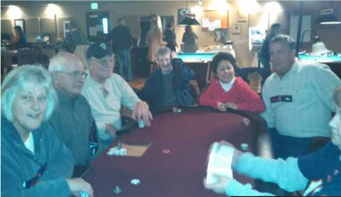
Card Players Enjoying the Bronco Game