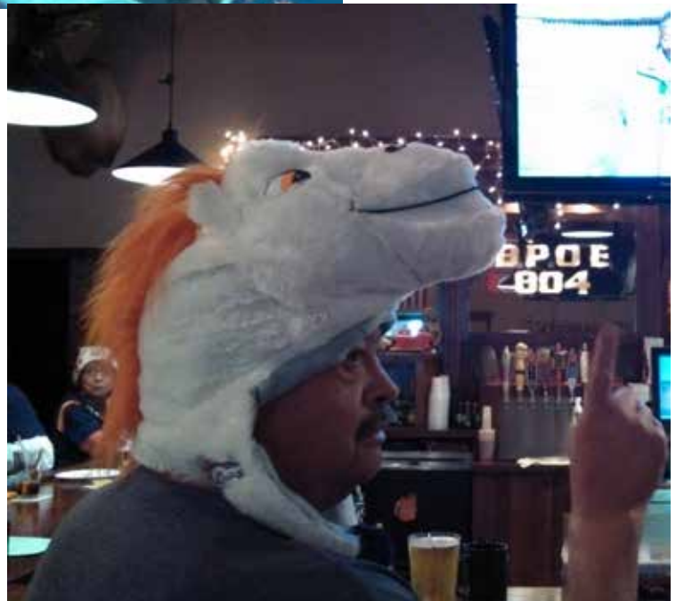
We normally do not allow horses in the lodge!