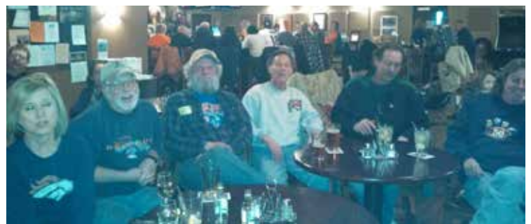
Some Happy Fans!