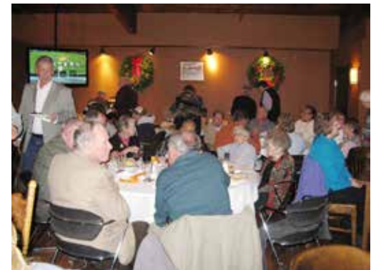
Member Christmas Party