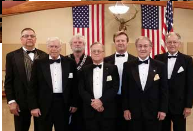
Installation of Officers March 2015