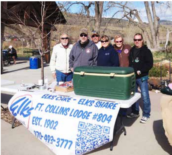
2015 Flying Pig Event