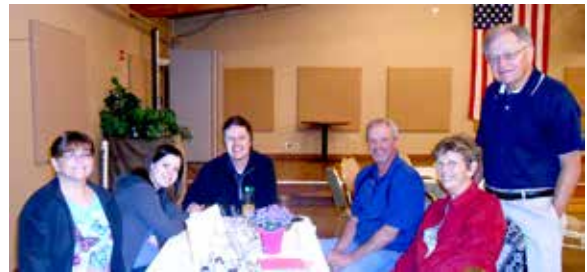
Frantz Family Celebrating Mother's Day

Laradon is now participating with GivingFirst, a program of Community First Foundation and an online resource featuring Denver area charities. Since Community First Foundation pays for all credit card fees, Laradon receives 100% of all contributions. To learn how you can help, call (303) 296-2400 or visit the website at www.laradon.org .