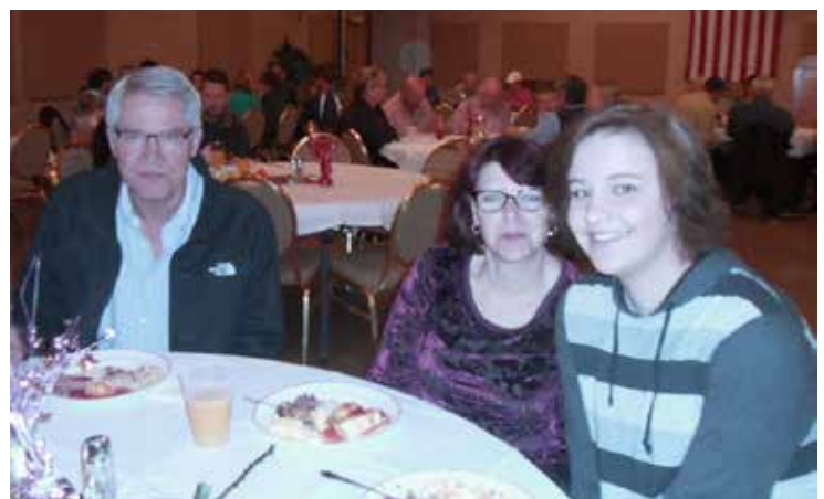
Sutton Family on Mother's Day