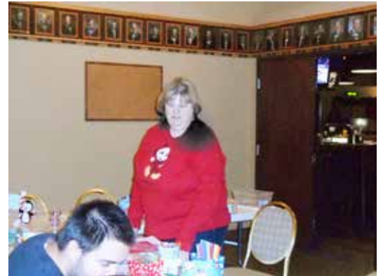
Members Who Participated In the Shopping Spree. Thanks to each of you!